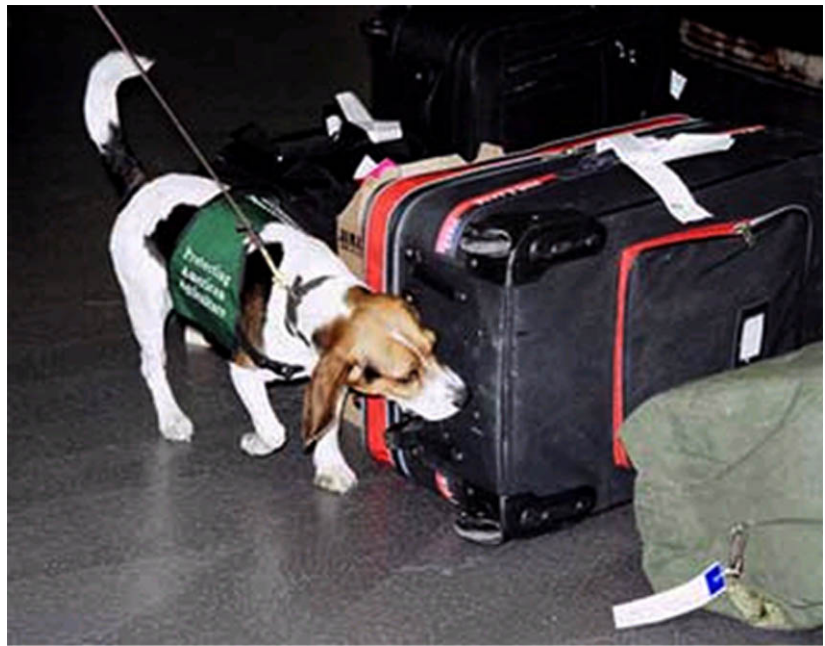
Member of the U.S. Customs & Border Protection Beagle Brigade inspecting luggage for agriculture contraband.

Medical tests have recently shown that specially trained dogs are capable of detecting certain types of tumors in humans.