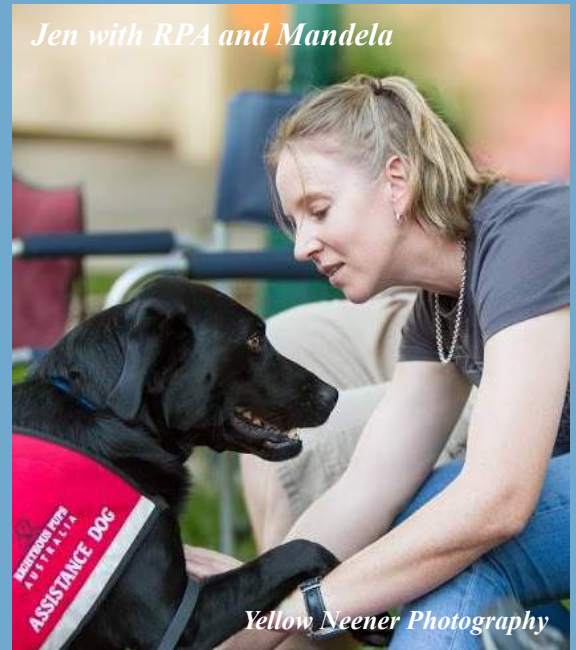
Yellow Neener Photography