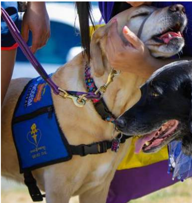
In loving memory of Rochelle... forever in our hearts. 2006 - 2016