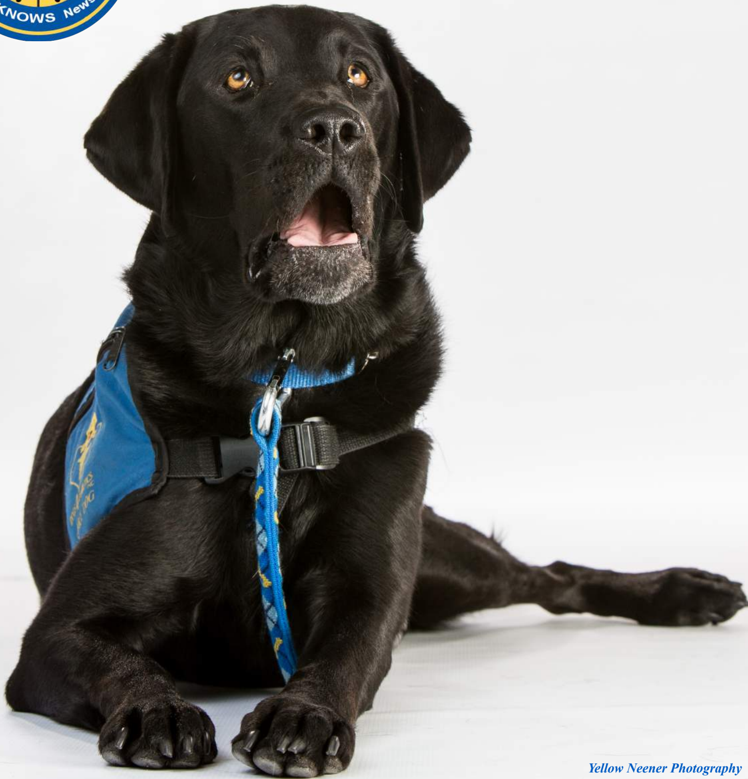
Yellow Neener Photography