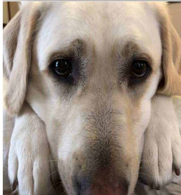
Reva getting spoiled... a look of complete relaxation after her doggy massage.