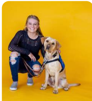
REESE & ROVER