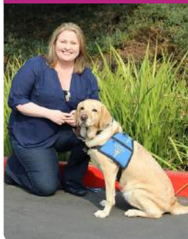
AISLING & TUCSON