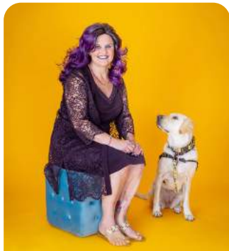
PEBBLES & COLLIER